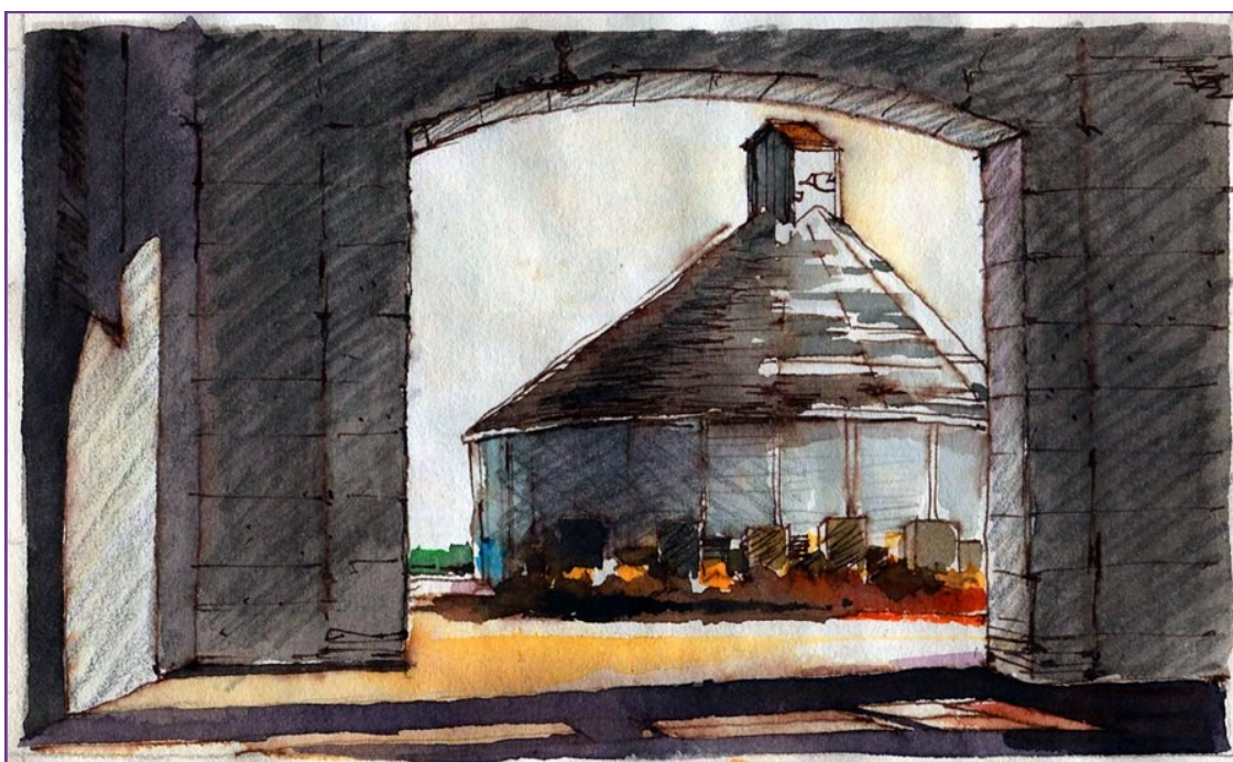
Sketch of the Ruins by Rolando Barrero

Award-winning water colorist, Rolando Barrero , will lead a class at the proposed Napa Valley Ruins in American Canyon. Paint in one of the most unique spots in Napa Valley! Space is limited, so sign up as soon as possible—ACAF Members receive priority.