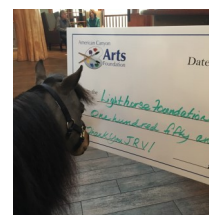
$150 to Lighthouse Foundation*