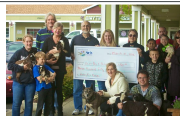
$350 to Barks & Bubbles, Lake County

$350 to Barks & Bubbles, to help with animal relief from the Lake