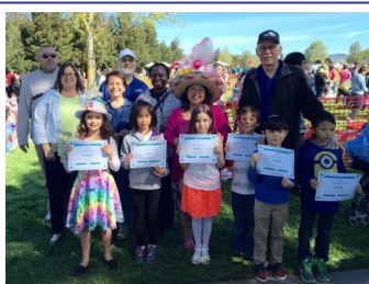
Some of this year's winners, with the Mayor and several ACAF Board Members.

Next year we are going to try something different, since our cement "canvas" is really the main walkway for the event!