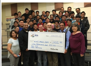
$1000 to ACHS Music Dept*