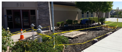
Construction site for the new 9/11 Memorial.

There wasn't a formal ground breaking event, but work has begun on the 9/11 Memorial, to be located at the Public Safety Building (Fire Station) at 911 Donaldson East, American Canyon.